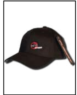
aFe Power Hat