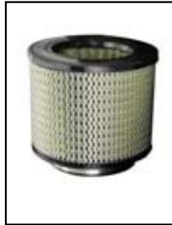
ProGuard-7 Air Filter