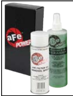
Blue Aerosol Restore Kit