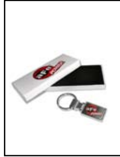
aFe Key Chain