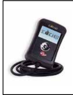
aFe Power Programmer