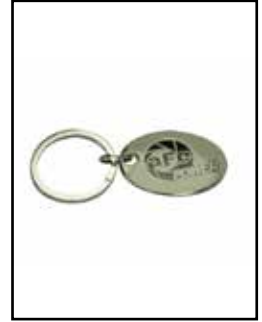
aFe Key Chain