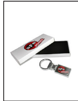
aFe Key Chain