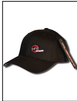
aFe Power Hat