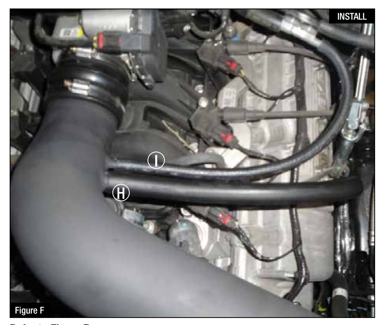
Refer to Figure F