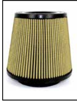
Pro GUARD 7 Air Filter