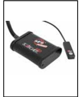
SCORCHER HD Module