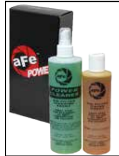
Gold Squeeze Restore Kit