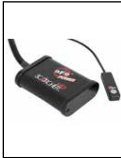
SCORCHER HD Module