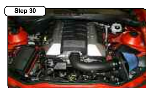
Installation complete. Retighten all connections after approximately 100-200 miles.