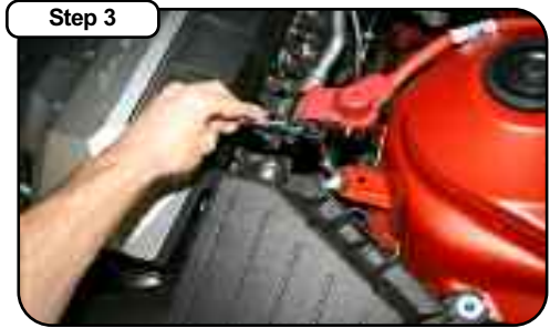
Remove nut from rear of air filter housing.