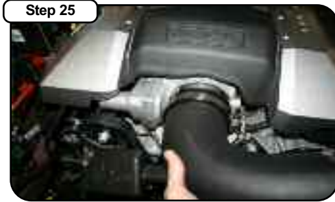
Connect aFe air intake tube to throttle body coupling.