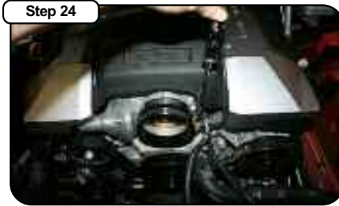
Install straight coupling and clamps (2) on throttle body inlet. Tighten clamp over throttle body.