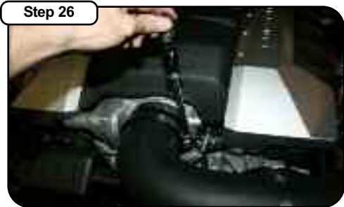
Tighten throttle body coupling clamps.