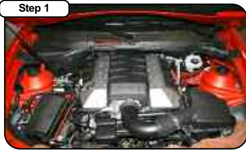
Complete stock intake system.