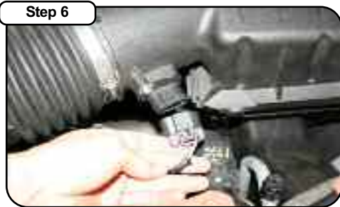
Unplug electrical harness from MAF sensor, location shown in figure B on step 5.