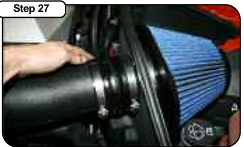
Connect aFe air intake tube to air filter adapter by sliding the loose coupling over to the right and tighten clamps.