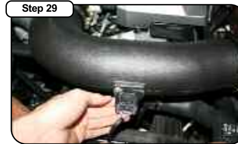
Plug electrical harness into MAF sensor.