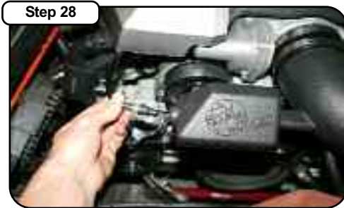
Insert breather line into aFe air intake tube.