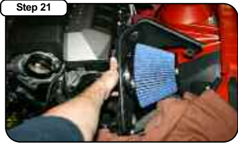
Install aFe housing into vehicle.