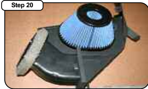
Insert factory air inlet duct into aFe housing.