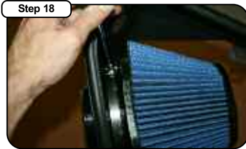
Tighten clamp to secure air filter to adapter.