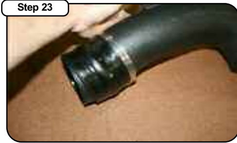
Slip on the supplied hump coupling onto the air intake tube and position clamps (2), do not tighten.