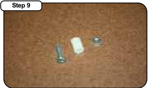
View of lower housing mount parts (screw, nylon spacer, nut).