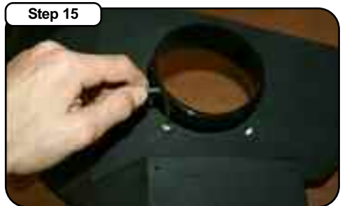
Secure air filter adapter to housing using supplied button-head screws.