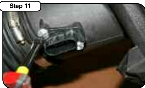
Remove MAF sensor from stock air intake tube.