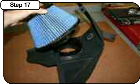
Install air filter on adapter.