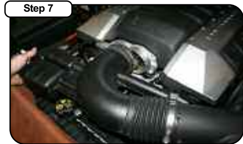
Disconnect air intake tube from throttle body.