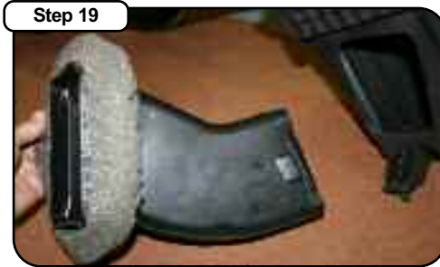
Remove air inlet duct from factory housing.