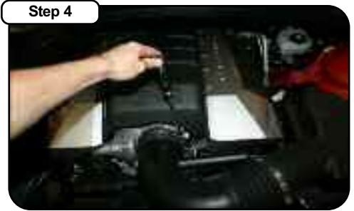
Loosen air intake tube clamp at throttle body inlet.