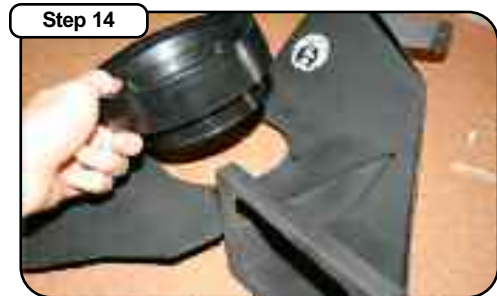
Install air filter adapter on aFe housing.