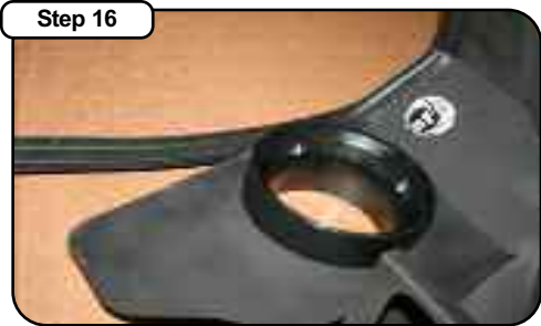
Install supplied trim seal on housing

Note: Filter Cleaning and Re-oiling: When cleaning your aFe filter, be sure to use only aFe's "Restore Kit" (aFe P/N: 90-50001 blue oil aerosol, aFe P/N: 90-50501 blue squeeze bottle oil, aFe P/N: 90-59999 Pro Dry S™ cleaner only.) Pro Dry S™ cleaning: see cleaning instruction sheet 06-00074. F