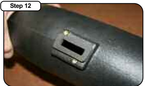
Remove white backing material and attach supplied gasket to aFe air intake tube.