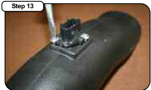
Install MAF sensor in aFe air intake tube using supplied 8/32 screws.