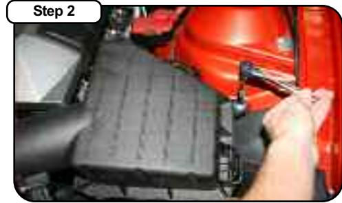
Remove nut from right side of air filter housing.