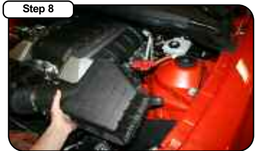
Remove complete factory intake system assembly from vehicle.