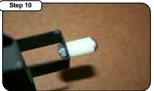
View of mount installed in housing.