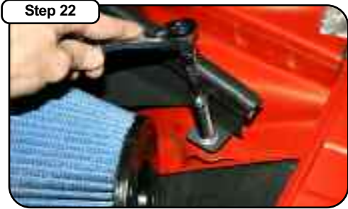
Install nuts removed in steps 2 and 3 in factory mounting locations.