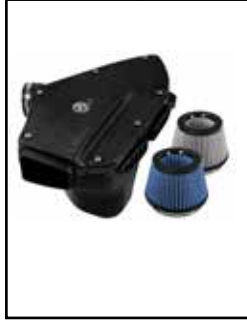
Air Intake System