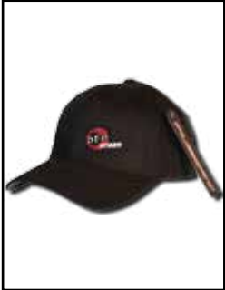
aFe Power Hat