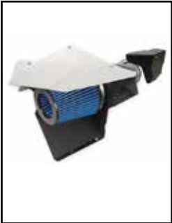
Air Intake System