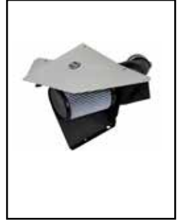
Air Intake System