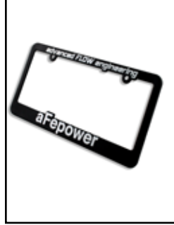
aFe License Plate Frame