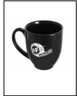
aFe power Mug