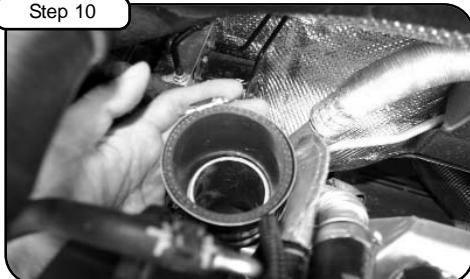
Place 2-1/2" coupler side onto turbo with clamps provided and tighten. (Make sure 2-3/4" side is facing up) Install intake tube from step 9.