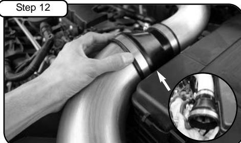
Place 2-3/4" x 4" reducer coupler on 2-3/4" tube side. Place 4" 90 degree tube onto 4" coupler side. Guide tab on 4" tube into isolation mount.