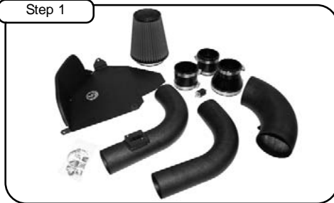
Complete kit with parts.