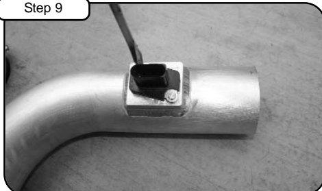
Install MAF sensor into new tube with screws provided and tighten using flat head screwdriver.