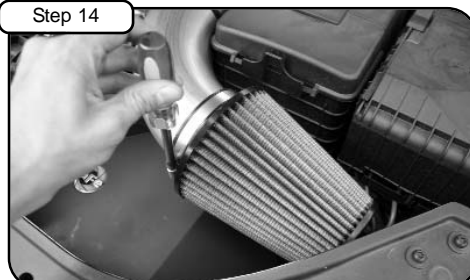
Install Air Filter and tighten using 5/16" nut driver. ( To ensure filter is engaged properly, mark a line 1" from the end of the tube, position filter flange at line and tighten clamp ).