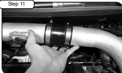
Place 2-3/4" x 3" straight coupler onto other 90 degree tube and install. Do not tighten.