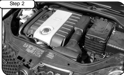
Complete stock intake.