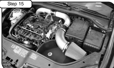
Your installation is now complete. Check all clamps and hoses periodically. Thank you for choosing aFe!

Note: Filter Cleaning and Re-oiling: When cleaning your aFe filter, be sure to use only aFe's "Restore Kit" ( aFe P/N: 90-50001 blue oil aerosol, or aFe P/N: 90-50501 blue squeeze bottle oil ). Filter Replacement P/N: 24-40507 ( black w/blue media ) Pro Dry S™ P/N: 21-40507 ( black w/white media ) Pro Dry S™ cleaning: see cleaning instruction sheet 06-00074