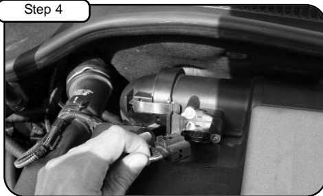
Disconnect the MAF harness and unclip the two clips holding in OE intake tube. Pull away OE tube from engine cover.