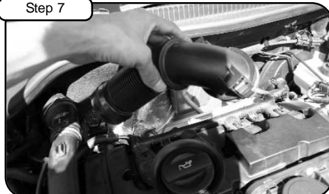
With pliers or channel locks, remove clamp off OE intake tube and remove from turbo. Also make sure OE turbo coupler is removed.