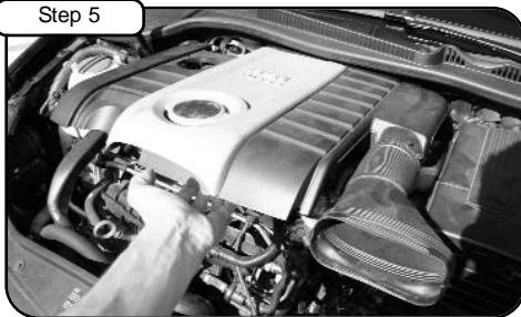
Carefully grab engine cover firmly, pull up and remove. (This may require some force)