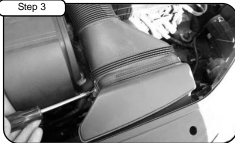
With T-20 torx bit, loosen the 2 bolts that hold in OE intake ram air unit and pull away.