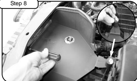
Install trim seal to housing and place into vehicle. Tighten using screws from step 6. Use provided M6 isolation mount to tighten housing down in front of battery.