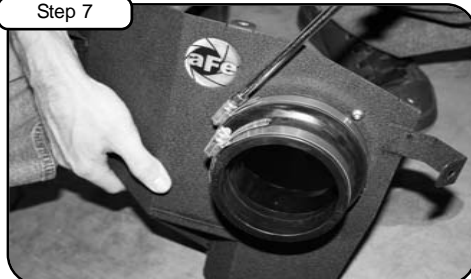
Step 7 Install coupler reducer to filter adaptor with clamps provided.