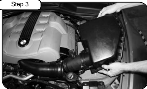
Step 3 Unclip upper half of air box and lift carefully. Pull back MAF sensor from OE tube.