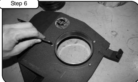
Step 6 Install filter adaptor using 3 button head screws & wavy washers. Tighten using 5mm allen key.