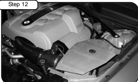
Step 12 Your installation is now complete. Please check all bolts and clamps periodically. Re-tighten if necessary. Thank you for choosing aFe!

Note: Filter Cleaning and Re-oiling: When cleaning your aFe filter, be sure to use only aFe's "Restore Kit" (aFe P/N: 90-50001 blue oil aerosol, or aFe P/N: 90-50501 blue squeeze bottle oil). Filter Replacement: Pro-5R™ PN: 24-91021 (black w/blue media). Pro Dry S™ P/N: 21-90044 (black w/white media) Pro Dry S™ cleaning: see cleaning instruction sheet 06-00074.