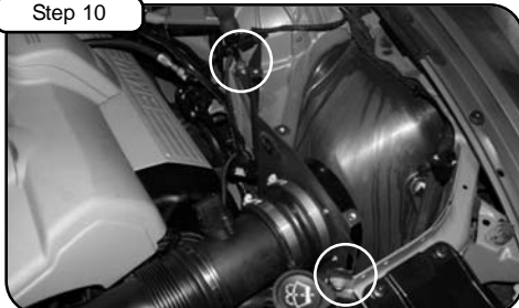
Step 10 Tighten housing using bolts from step 4 and 8. Tighten all clamps using 5/16" nut driver.