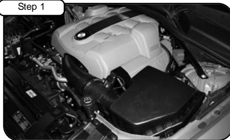
Step 1 Complete Stock Intake.