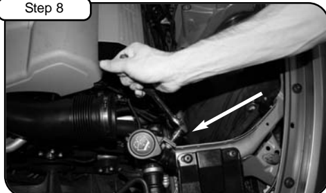
Step 8 With 10mm socket loosen the bolt holding in windshield washer reservoir. Save bolt for later install.