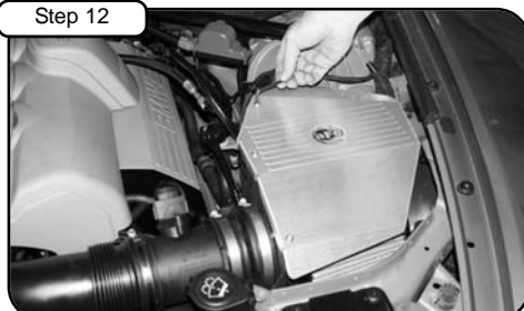
Step 12 Install cover on housing using button head screws provided and tighten using 5mm allen key.