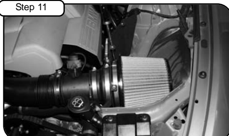
Step 11 Install air filter and tighten using 5/16" nut driver. Re-connect MAF sensor harness.