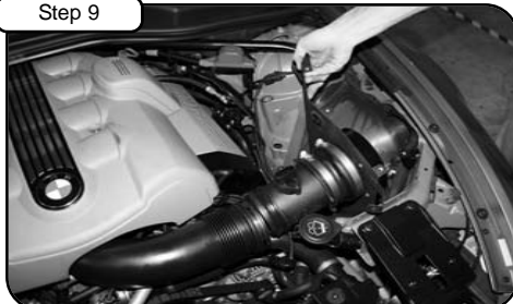
Step 9 Place MAF sensor into intake tube. (Make sure MAF sensor arrow is in direction towards throttle body.) Now install housing into vehicle. Place other end of MAF sensor into coupler. Do not tighten clamps.