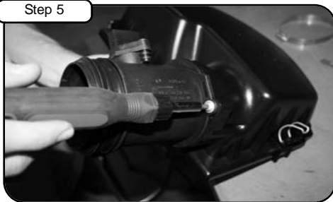
Step 5 Remove MAF sensor using T30 torx bit.