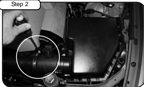
Step 2 Disconnect MAF sensor harness. Loosen clamps with 1/4" nut driver.