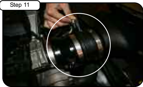
Re-connect MAF sensor harness and vacuum line.