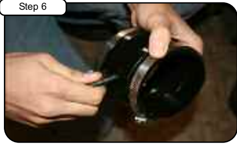
Remove OE plastic fitting from tube and install into new coupler.