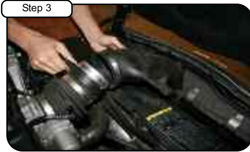
Lift up air box carefully from middle. Pull back MAF sensor from OE tube.