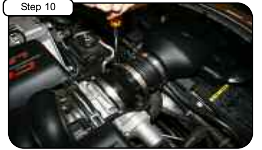
Tighten all clamps using 5/16" nut driver.