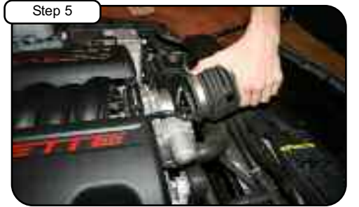
Remove OE tube with MAF sensor.