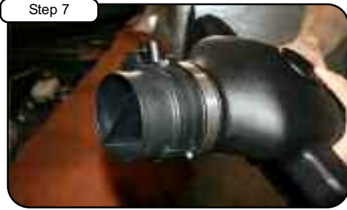
Install MAF sensor to inside of tube with clamp. Do not tighten.