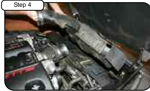
Take air box out of vehicle.