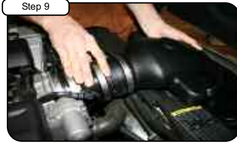
Install coupler to throttle body using clamps provided. Place tube to factory position and install completely. Do not tighten.