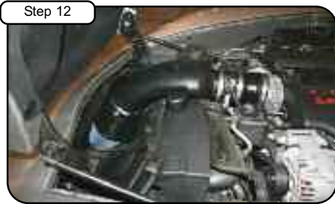
Place enclosed CARB EO sticker on a clean/smooth surface on or near the intake system. EO identification label is required in passing the Smog Check Inspection. Your installation is now complete. Please check all bolts and clamps periodically. Re-tighten if necessary. Thank you for choosing aFe!

Note: Filter Cleaning and Re-oiling: When cleaning your aFe filter, be sure to use only aFe's "Restore Kit" (aFe P/N: 90-50001 blue oil aerosol, or aFe P/N: 90-50501 blue squeeze bottle oil). Filter Replacement: Pro-5R™ P/N: 24-90033 (black w/blue media). Pro Dry S™ P/N: 21-90033 (black w/white media) Pro Dry S™ cleaning: see cleaning instruction sheet 06-00074.