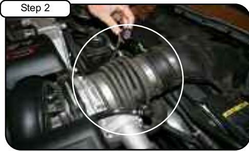
Disconnect MAF sensor harness and vacuum line. Loosen clamps with 5/16" nut driver.