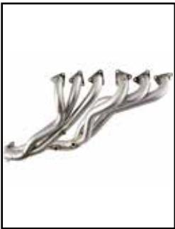
Twisted Steel Headers