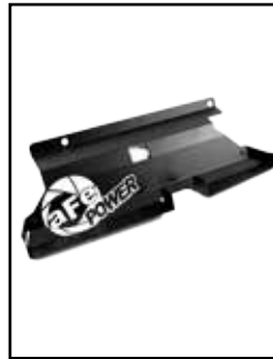
Dynamic Air Scoop