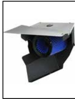
Air Intake System