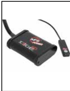
SCORCHER HD Module