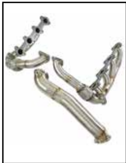
Headers + Up Pipes

P/N: 49-44043-B (Blk. Tip) 49-44043-P (Pol. Tip)