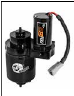
DFS PRO Fuel System