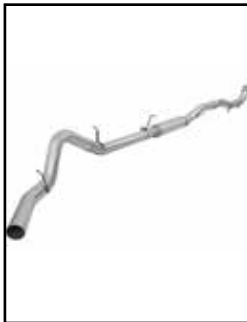
Downpipe Back Exhaust