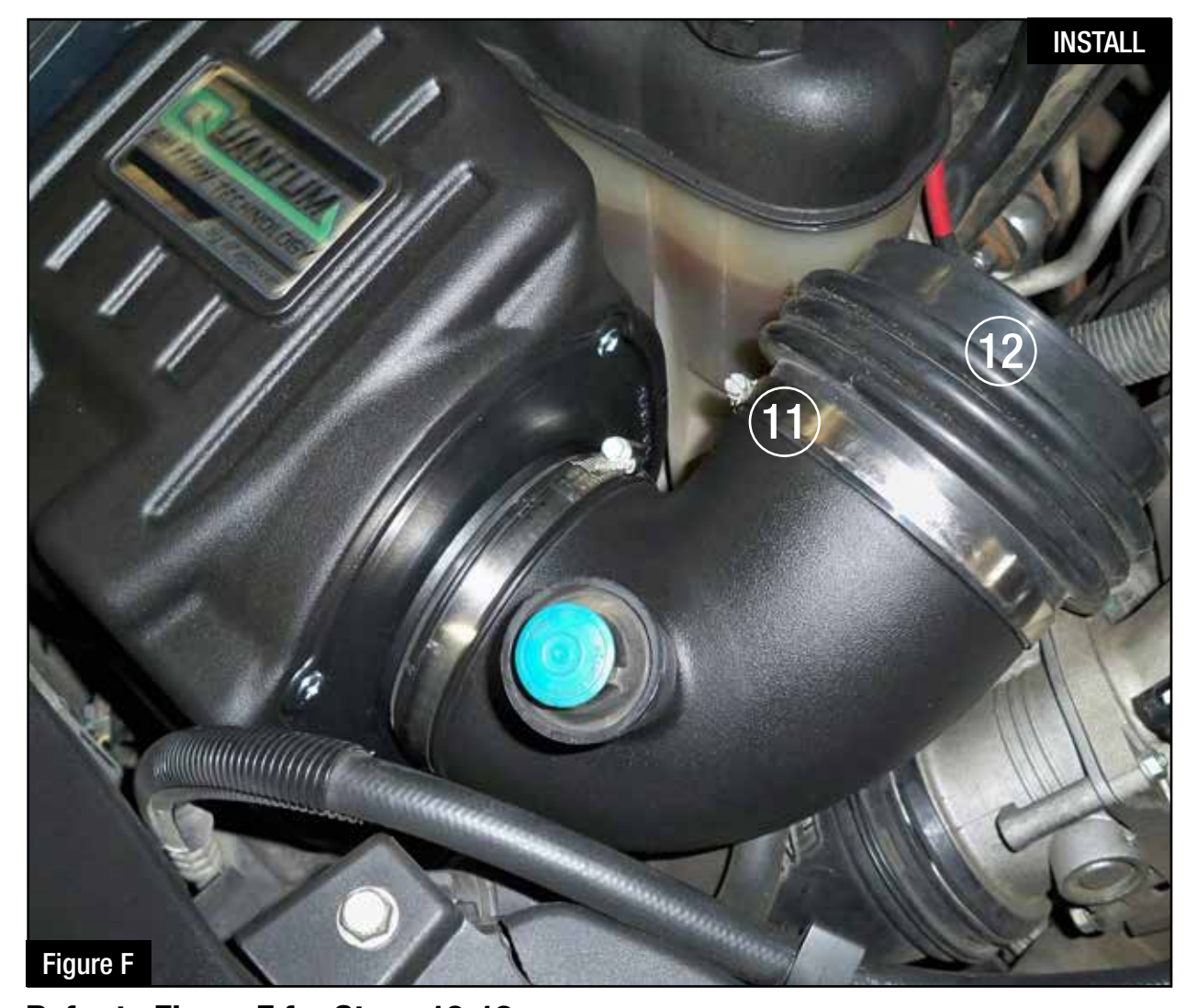
Refer to Figure F for Steps 12-13

Step 12: Install the aFe elbow tube assembly onto the filter coupling. Align elbow tube but do not tighten the clamp.