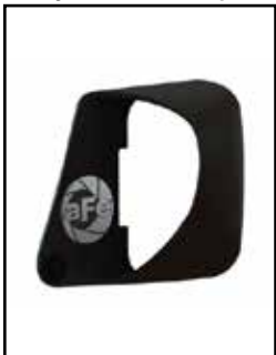
Dynamic Air Scoop