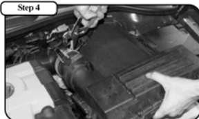
With a pair of pliers, loosen the clamp holding the MAF sensor to the stock intake tube and remove the cover and sensor from the vehicle.