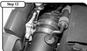
Tighten all clamps.