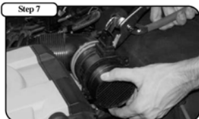
Re-insert the MAF sensor into the stock intake tube.