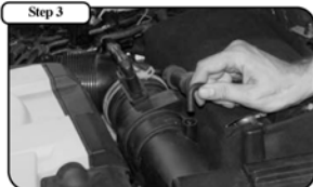
Disconnect the MAF sensor and unplug the breather tube that are located on the top side of the stock intake tube.