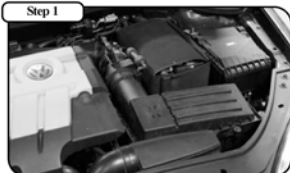
Complete stock intake.