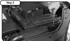
Remove the (8) screws holding the stock cover to the housing.