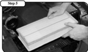
Remove the stock air filter and plastic grill from the factory air box.