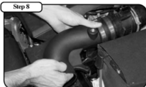
Insert the aFe intake tube along with the coupling and clamps onto the MAF sensor. Secure the intake tube using the provided screws.