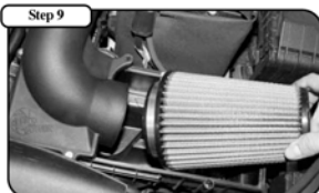
Install the aFe air filter onto the aFe intake tube.