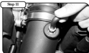
Push the breather tube onto the brass nipple. The special fitting does not require a clamp.