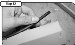
Place trim seal on the bottom side of the intake cover.