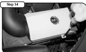
Secure the cover to the housing by tightening two of the stock screws using a phillips screwdriver. Use one of the screws provided for the tab that sits on the intake tube.