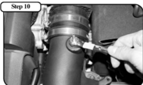
Tighten the Brass Nipple using either a box wrench or a deep socket.