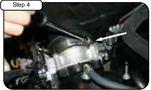
With 5/16" nut driver loosen both clamps on OE intake tube. Remove crankcase and vacuum line away from tube. Disconnect MAF sensor harness & remove.