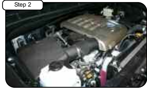
Complete stock intake.