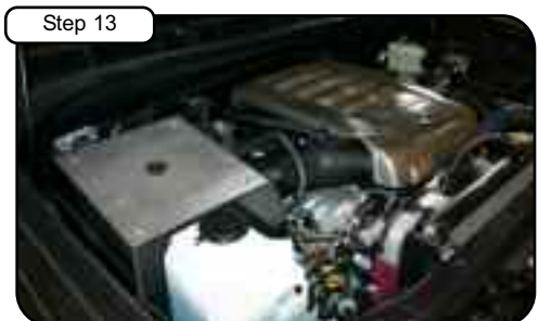
Your installation is now complete. Check all clamps and hoses periodically. Thank you for choosing aFe!