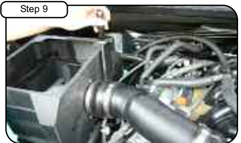
Tighten clamps with 5/16" nut driver. Take out OE crankcase line and replace with 1/2" hose and clamp provided.