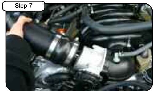
With couplers and clamps provided, place onto new intake tube and install. Make sure 4-1/4" coupler is on filter side and 3-1/2" coupler is on throttle body side.