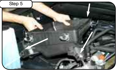
With 12mm socket with extension, loosen the 3 bolts and remove the OE air box out of vehicle. Note: Save 3 bolts and grommets for later install.