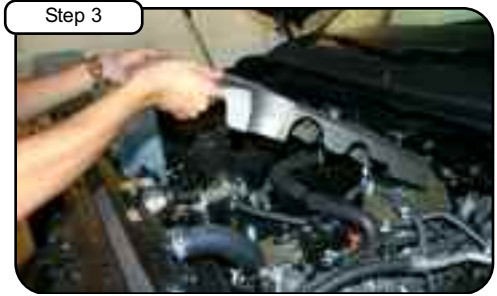
Lift up and remove engine cover.