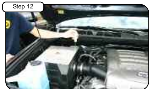
With button head screws provided tighten down housing cover with 5/32" allen key. Re-Install engine cover.