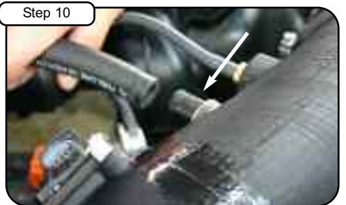
Connect 1/2" hose to new tube and tighten clamp with flat-head screwdriver. Re-connect MAF sensor harness and fuel regulator.