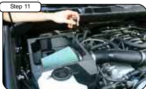
Place air filter into housing and tighten using 5/16" nut driver.