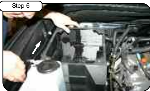
Install trim seal provided to auxiliary on side. Install filter adaptor to new housing with button head screws provided and secure. Install new housing using screws and grommets from step 5.