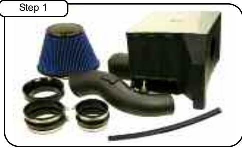
Complete kit with parts.