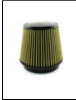
Pro GUARD 7 Air Filter