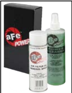
Gold Aerosol Restore Kit