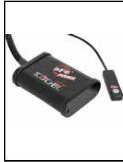
SCORCHER GT Module

P/N: 48-36302-HC (Street) 48-36302-HN (Race)