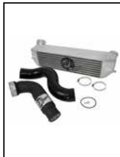
Intercooler w/ Tubes