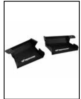
Dynamic Air Scoops