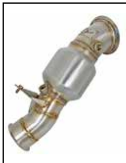
Twisted Steel Down-Pipe

P/N: 48-36316-HC (Street) 48-36316-HN (Race)