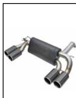
Axle-Back Exhaust System

P/N: 49-36333-C (C/F Tips) 49-36333-B (Blk Tips) 49-36333-P (Pol Tips)