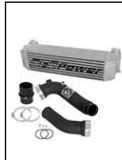
Intercooler w/ Tube