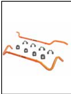
aFe CONTROL Sway Bars