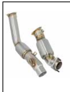
Twisted Steel Downpipes

P/N: 48-36312-1 (Street) 48-36313 (Race)