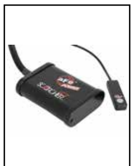
SCORCHER GT Module