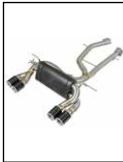
Axle-Back Exhaust System

P/N: 49-36338-C (C/F Tips) 49-36338-P (Pol Tips)