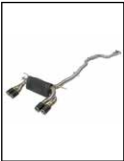
DP-Back Exhaust System

P/N: 49-36337-C (C/F Tips) 49-36337-P (Pol Tips)