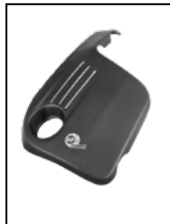
Carbon Fiber Engine Cover

P/N: 49-36338-C (C/F Tips) 49-36338-P (Pol Tips)