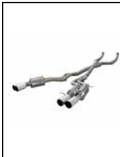
aFe Cat-Back Exhaust