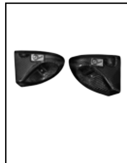
Dynamic Air Scoops