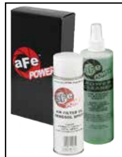
Blue Aerosol Restore Kit