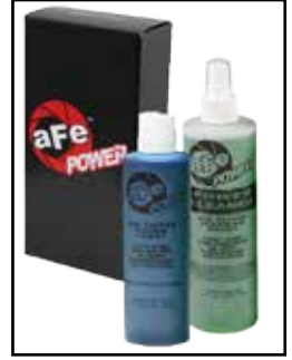
Blue Squeeze Restore Kit