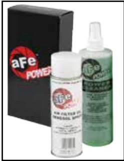
Blue Aerosol Restore Kit