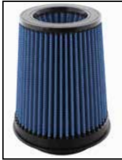
Pro 5R Air Filter