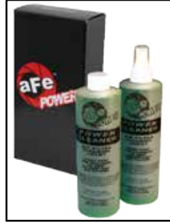
Pro DRY S Restore Kit