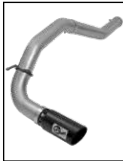
DPF-Back Exhaust System

P/N: 49-46113-B (Blk Tip) 49-46113-P (Pol Tip)