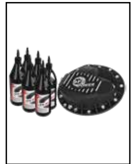
Rear Differential Cover

P/N: 46-70362-WL (w/ Oil) 46-70360 (RAW)