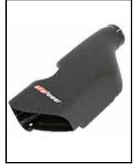
Dynamic Air Scoop