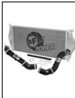
Intercooler w/ Tubes

P/N: 49-46113-B (Blk Tip) 49-46113-P (Pol Tip)