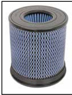
Pro 10R Air Filter