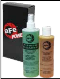
Gold Squeeze Restore Kit