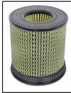
Pro-GUARD 7 Air Filter