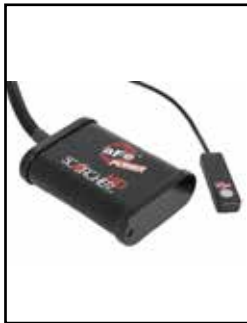
SCORCHER HD Module