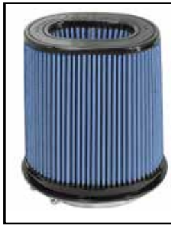
Pro 10R Air Filter