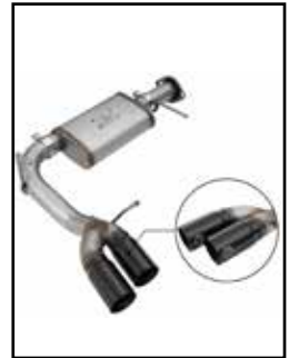
Side Exit Exhaust

P/N: 49-44061-B (w/ Blk Tip) 49-44061-P (w/ Pol Tip)