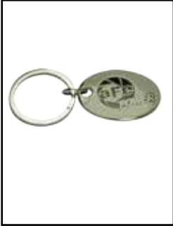
aFe Key Chain