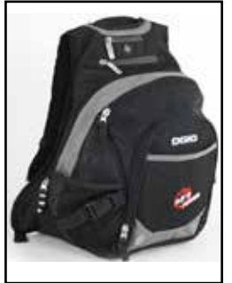
aFe Power Backpack