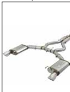
Exhaust Sport Cat-Back

P/N: 49-33087-B (Blk Tip) 49-33087-P (Pol Tip)