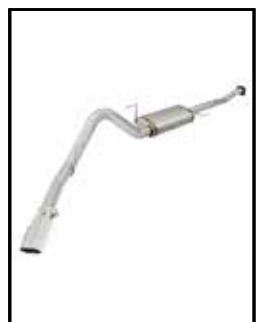
Cat-Back Exhaust System