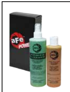
Pro-GUARD 7 Restore Kit