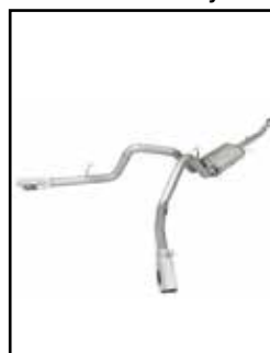
Cat-Back Exhaust System