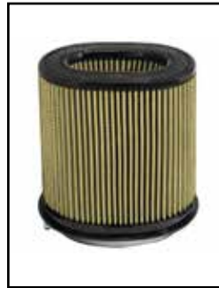
PRO GUARD 7