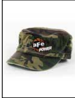
aFe Power Ladies Hat

P/N: 40-10114 (S/M) P/N: 40-10115 (L/XL)