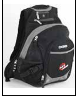
aFe Power Backpack