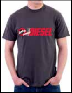
aFe Power Diesel T-Shirt

P/N: 40-30222 (L) P/N: 40-30223 (XL) P/N: 40-30224 (2XL) P/N: 40-30225 (3XL)