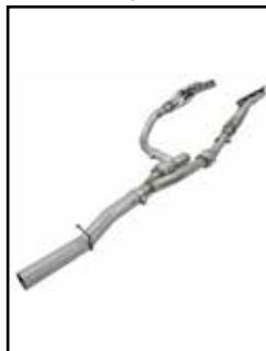
Headers w/ Connection Pipes

P/N: 48-42013-YC (Street) 48-42013-YN (Race)