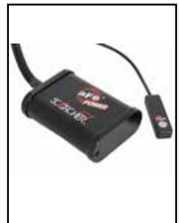
SCORCHER GT Module