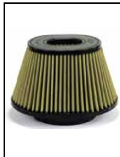
Pro-GUARD 7 Air Filter