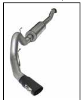
Cat-Back Exhaust System

P/N: 49-43069-B (Blk Tip) 49-43069-P (Pol Tip)