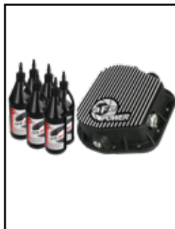
Rear Differential Cover

P/N: 46-70152-WL (w/ Oil) 46-70152 (Blk./Mach.) 46-70150 (RAW)