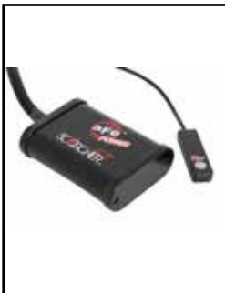
SCORCHER GT Module