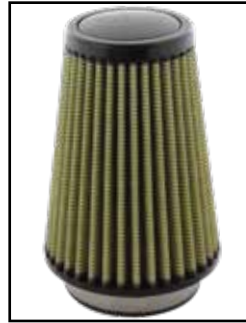
Pro-GUARD 7 Air Filter