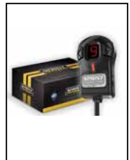
Sprint Booster V3