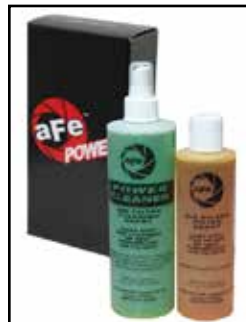
Gold Squeeze Restore Kit