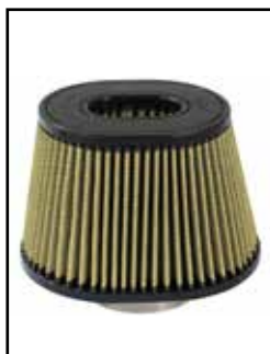
Pro GUARD Air Filter