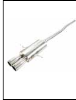
aFe Cat-Back Exhaust