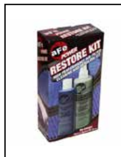
Pro 5R Restore Kit Squeeze