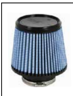
Pro 5R Air Filter