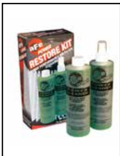
Pro DRY S Restore Kit