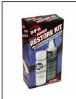
Pro 5R Restore Kit Aerosol