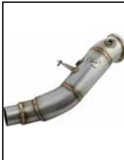
Twisted Steel Header