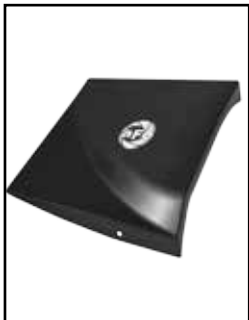
Cover Kit Stage 2