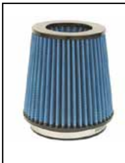
Pro 5R Air Filter