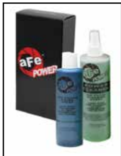
Blue Squeeze Restore Kit