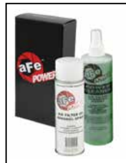
Pro DRY S Restore Kit