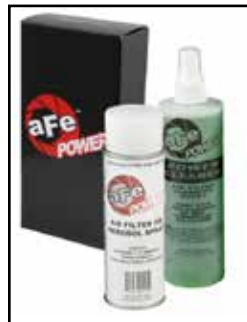
Blue Aerosol Restore Kit