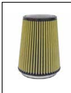
Pro-GUARD 7 Air Filter