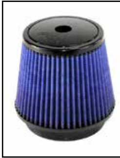
Pro 5R Air Filter