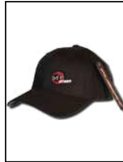
aFe Power Hat