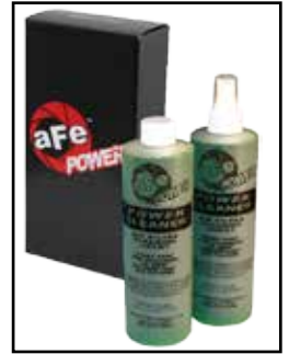
Pro DRY S Restore Kit

P/N: 28-10081 Yellow P/N: 28-10082 Red P/N: 28-10083 Black P/N: 28-10084 Blue