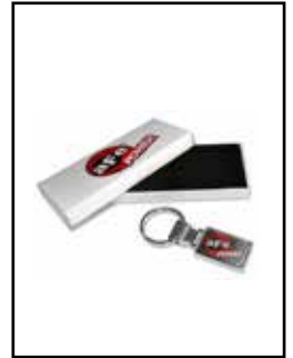
aFe Key Chain