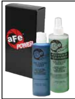
Blue Squeeze Restore Kit