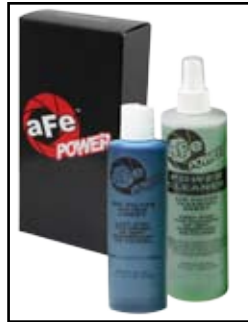
Blue Squeeze Restore Kit