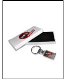
aFe Key Chain