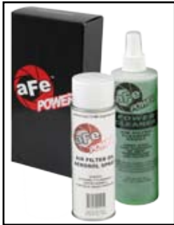
Blue Aerosol Restore Kit