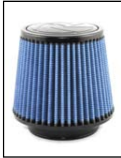
Pro 5R Air Filter