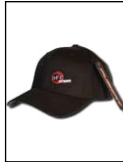
aFe Power Hat