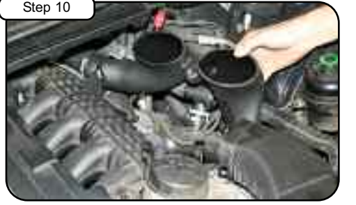
Step 10 Install new tube into vehicle and pull back towards driver fender. Do not tighten clamps.