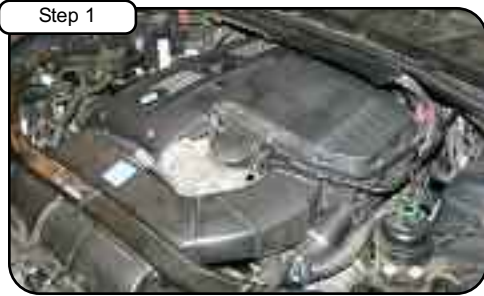
Step 1 Complete Stock Intake.