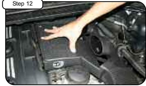
Step 12 Push down housing allowing grommets to seat. Align threaded insert with hole on housing.