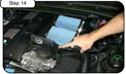
Step 14 Install air filters and tighten with 5/16" nut driver and connect vacuum line.