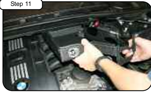
Step 11 Install housing into factory position.