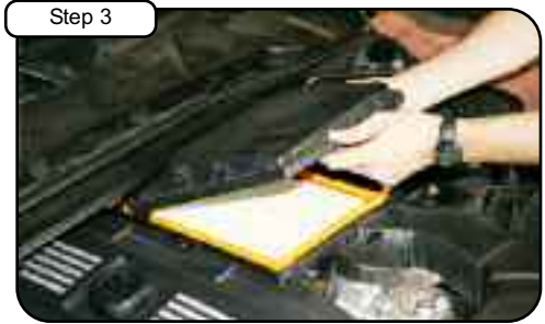
Step 3 Unclip upper half of air box to remove lid and filter.