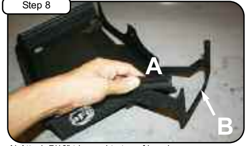
Step 8 A) Attach 7/16" trim seal to top of housing. B) Attach rubber edge trim seal to ram air cut out on housing.