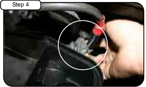
Step 4 Pull back rubber mount attached to battery cable. Use pliers if necessary. This will allow stock clamp to be loosened. (To be done in step 5B.)