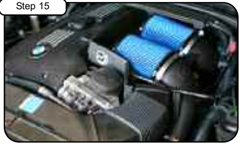
Step 15 Your installation is now complete. Please check all clamps and hoses periodically and tighten. Thank you for choosing aFe!