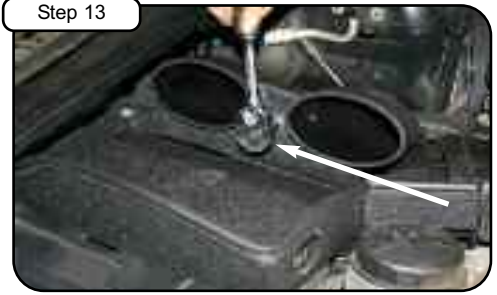
Step 13 Install screw, washer and wavy washer provided, and tighten with 10mm socket or wrench. Tighten clamps to tube with 1/4" nut driver.