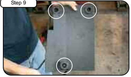
Step 9 Install rubber grommets from step 7 on new housing.