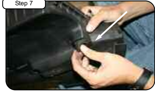
Step 7 Remove the 3 rubber grommets from the air box. (To be used in step 9.)