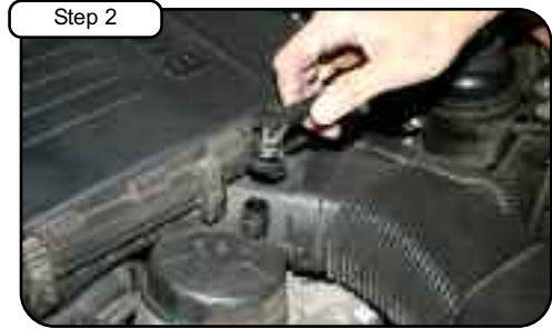
Step 2 Disconnect vacuum line and pull back.