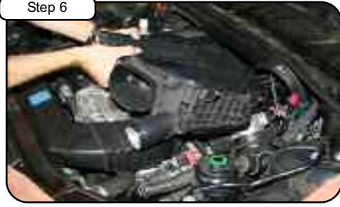
Step 6 Remove complete air box from vehicle.