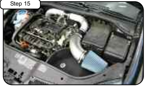
Note: Retighten all connections after approximately 100-200 miles. Your installation is now complete. Check all clamps and hoses periodically. Thank you for choosing aFe!

Note: Filter Cleaning and Re-oiling: When cleaning your aFe filter, be sure to use only aFe's "Restore Kit" ( aFe P/N: 90-50001 blue oil aerosol, or aFe P/N: 90-50501 blue squeeze bottle oil ). Filter Replacement P/N: 24-40507 ( black w/blue media ) Pro Dry 5 ™ P/N: 21-40507 ( black w/white media ) Pro Dry 5 ™ cleaning: see cleaning instruction sheet 06-00074