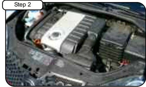
Complete stock intake.