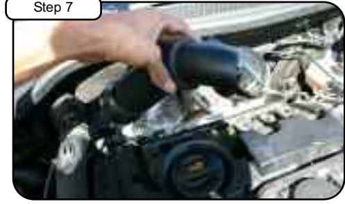
With pliers or channel locks, remove clamp off OE intake tube and remove from turbo. Also make sure OE turbo coupler is removed.