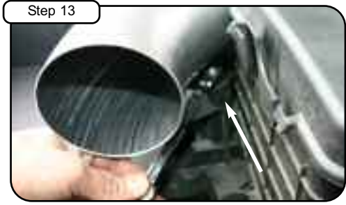
Tighten Isolation mount with M6 nut and washer provided. Make sure tab is on isolation mount. Adjust height and tighten all clamps on intake tubes with 5/16" nut driver.