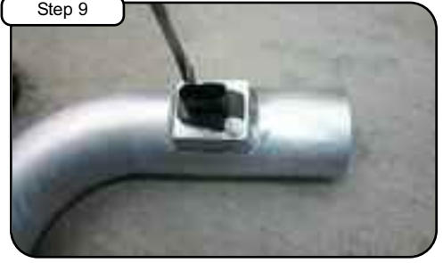
Install MAF sensor into new tube with screws provided and tighten using flat head screwdriver.