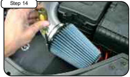
Install Air Filter and tighten using 5/16" nut driver. ( To ensure filter is engaged properly, mark a line 1" from the end of the tube, position filter flange at line and tighten clamp ).