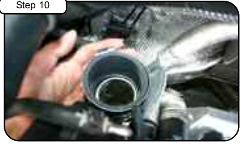
Place 2-1/2" coupler side onto turbo with clamps provided and tighten. (Make sure 2-3/4" side is facing up) Install intake tube from step 9.