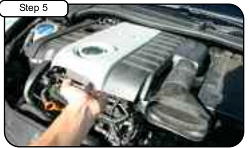
Carefully grab engine cover firmly, pull up and remove. (This may require some force)