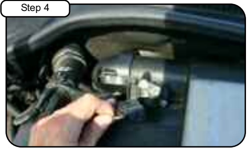
Disconnect the MAF harness and unclip the two clips holding in OE intake tube. Pull away OE tube from engine cover.