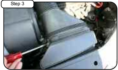
With T-20 torx bit, loosen the 2 bolts that hold in OE intake ram air unit and pull away.