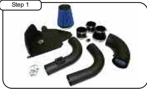
Complete kit with parts.