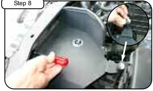
Install trim seal to housing and place into vehicle. Tighten using screws from step 6. Use provided M6 isolation mount to tighten housing down in front of battery.