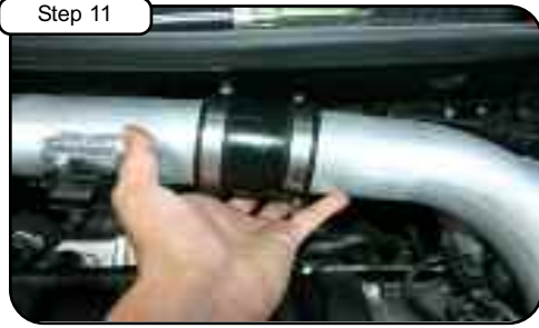
Place 2-3/4" x 3" straight coupler onto other 90 degree tube and install. Do not tighten.