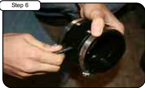
Remove OE plastic fitting from tube and install into new coupler.