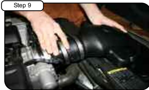
Install coupler to throttle body using clamps provided. Place tube to factory position and install completely. Do not tighten.