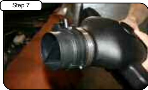
Install MAF sensor to inside of tube with clamp. Do not tighten.