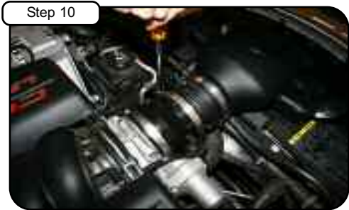
Tighten all clamps using 5/16" nut driver.