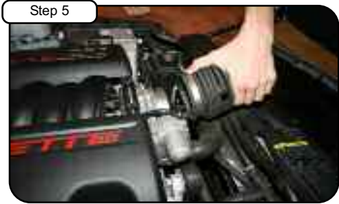
Remove OE tube with MAF sensor.