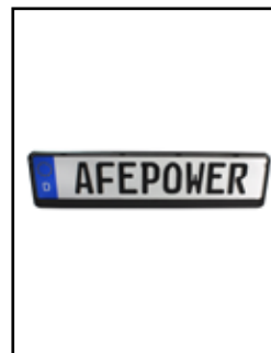
aFe License Plate