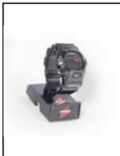
aFe G-Shock Watch