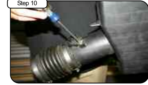
Step 10 Carefully remove the MAF sensor from the OEM air box lid.