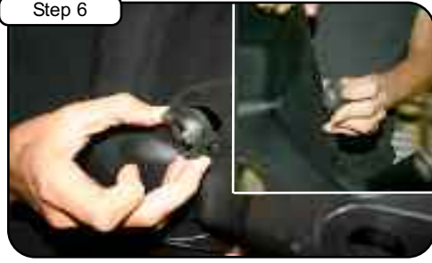
Step 6 Transfer the rubber vibration mounts located on the bottom of the air box over to the new housing.