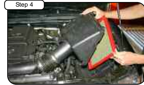
Step 4 Remove the upper portion of the air box and the factory air filter.