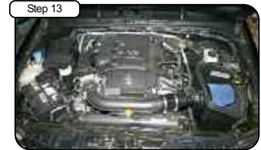
Step 13 Place enclosed CARB EO sticker on a clean/smooth surface on or near the intake system. EO identification label is required in passing the smog check inspection. Your installation is now complete.