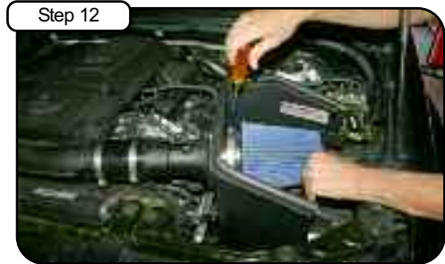
Step 12 Install the pre oiled air filter. Do not use any grease or oil. Secure with the provided clamp. Make sure you tighten all clamps and check all electrical connections. Re check periodically.