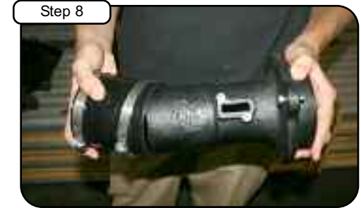
Step 8 Place the coupler on to the intake tube. Do not tighten clamps at this time.