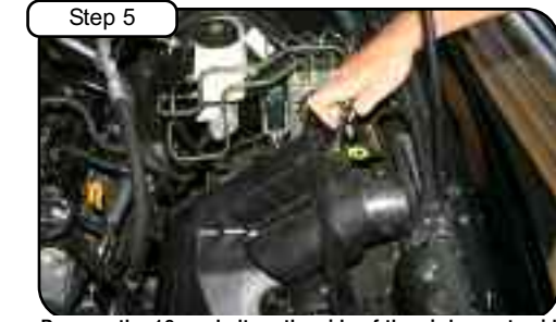
Step 5 Remove the 10mm bolt on the side of the air box set aside for later use. Lift the lower air box up and out of the engine bay.