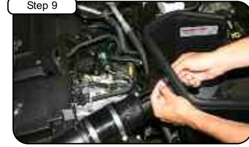
Step 9 Slide the intake tube assembly into the housing. Secure the tube to the housing with the supplied M6 hardware. Tighten and secure the hose clamp.