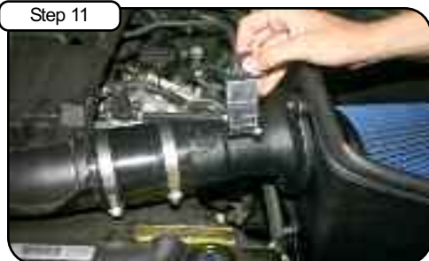
Step 11 Transfer the MAF sensor to the aFe intake tube. Secure with the supplied gaskets, spacers, and screws. Make sure you pay attention to the direction of the arrow on the MAF sensor.