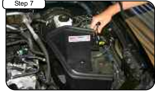
Step 7 Place the rubber trim seal along the edge of the housing. Lower the housing into the engine bay secure housing with the bolt removed in step 5.