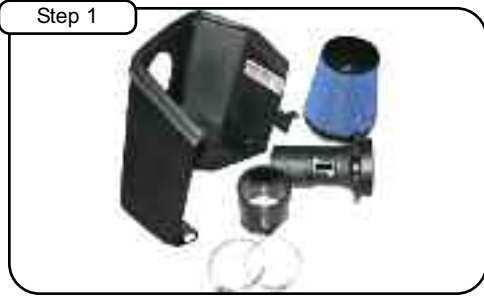
Step 1 Complete kit. Please verify all components are present prior to beginning installation.