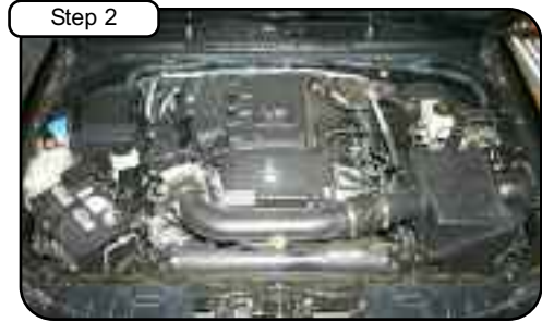
Step 2 Complete stock intake.