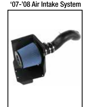
P/N: 51-11072 (PDS) 54-11072 (P5R)