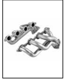
P/N: 48-44001 ('02-'13)