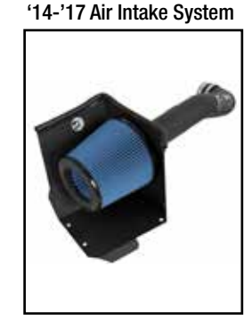
P/N: 51-12332 (PDS) 54-12332 (P5R)