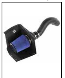
P/N: 51-10092 (PDS) 54-10092 (P5R)