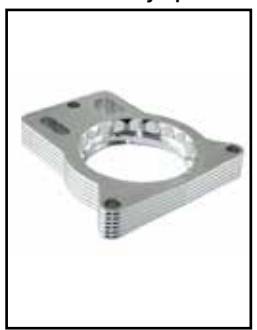
P/N: 46-34001 ('99-'07)