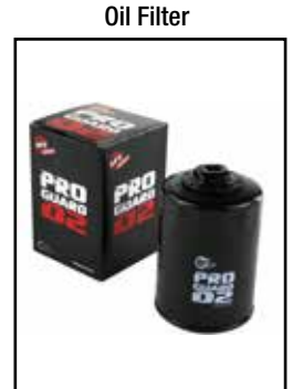
P/N: 44-LF025 ('14-'17)