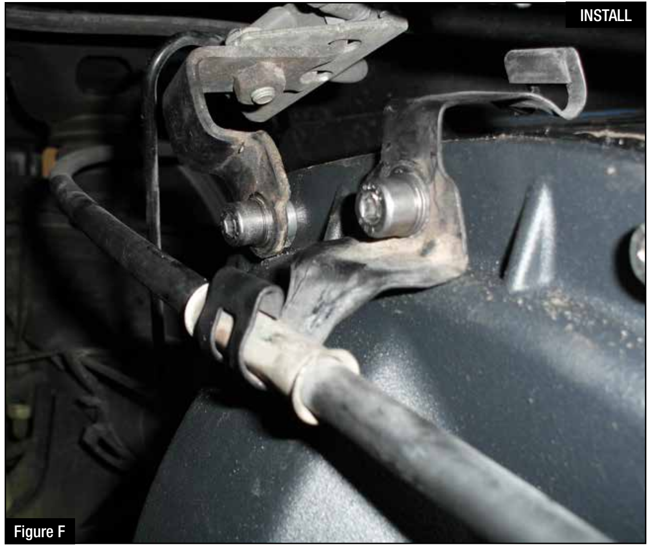
Refer to Figure F for steps 13-14

Step 13: Use the 40mm long shcs and spacers to secure the brackets at the top of the cover. The emergency brake cable bracket requires two washers under the screw head.