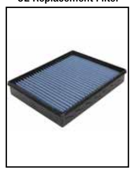
P/N: 30-10004 (P5R) 31-10004 (PDS)