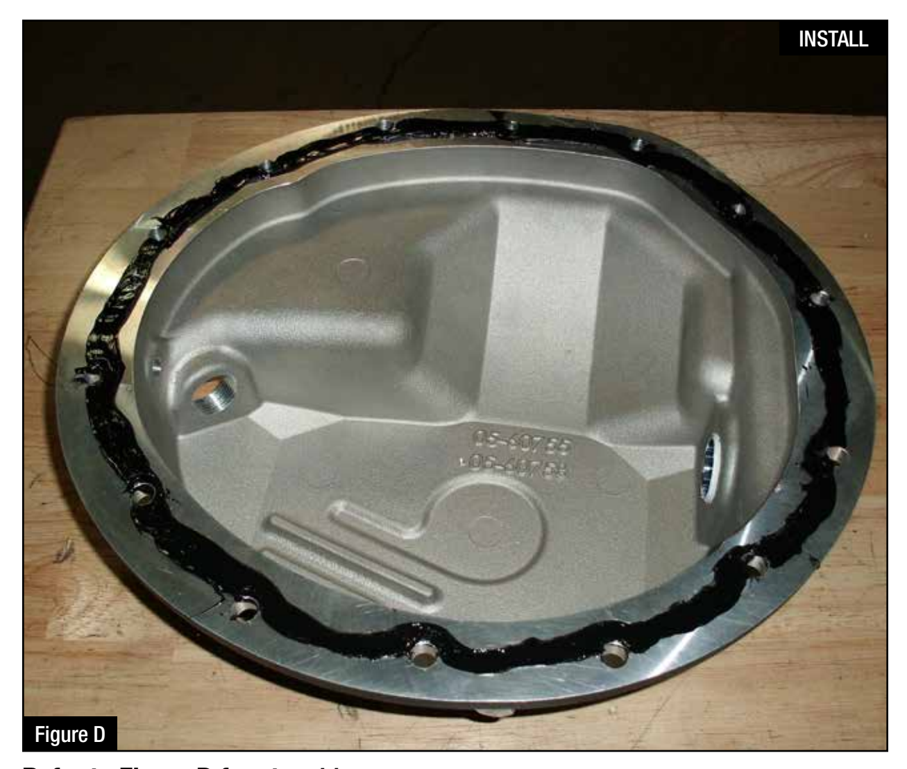
Refer to Figure D for step 11

Step 11: Using the silicone provided, lay a continous bead around the cover.