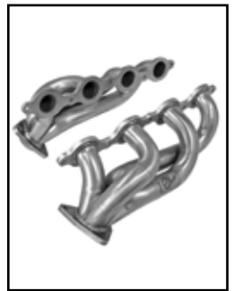
P/N: 48-44003 ('14-'16)