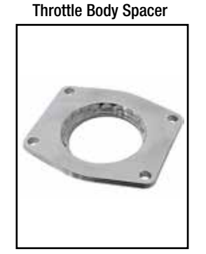
P/N: 46-34008 ('14-'17)