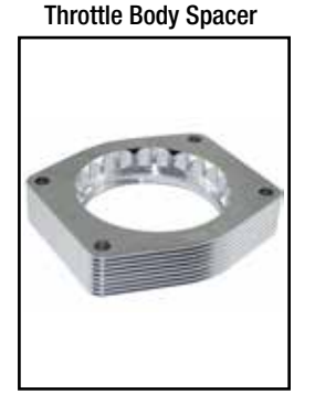
P/N: 46-34003 ('07-'13)