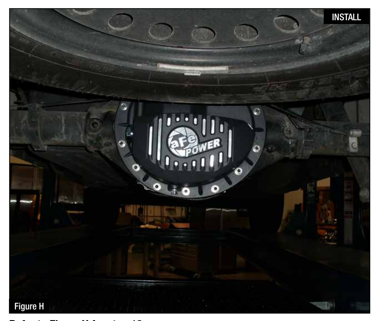
Refer to Figure H for step 18

Step 18: Your installation is now complete.