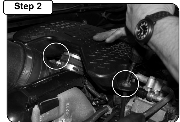
Step 2 Remove resonator plenum: remove mounting screw with T30 Torx driver. Loosen clamp with flathead screw driver or 1/4" socket driver.