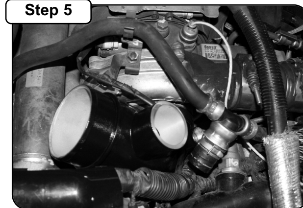
Step 5 Install aFe turbo inlet tube. Ensure flange clamp fit correctly on turbo inlet tube and turbo. Do not tighten clamp.