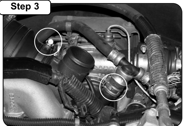
Step 3 Open clamp on CCV hose coupler with pliers and remove coupler from the stock turbo inlet tube. Loosen air intake coupler clamp at stock turbo inlet tube with flathead screw driver or 5/16" socket driver.