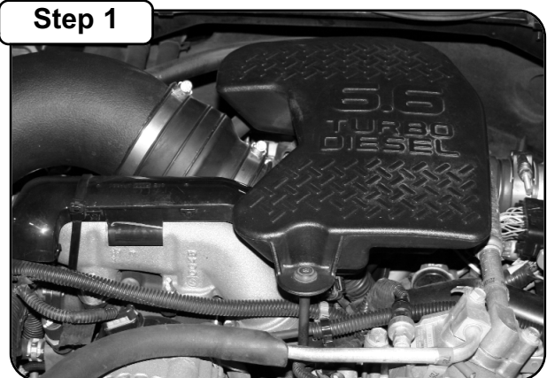
Stock turbo inlet tube.