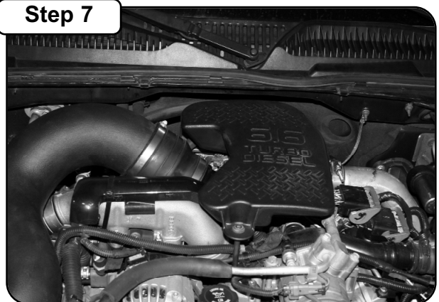
Step 7 Re-attach resonator plenum on aFe turbo inlet tube. Tighten clamp with flathead screw driver or 1/4" socket driver. Re-install mounting screw with T30 Torx driver. Your installation is now complete. Thank you for choosing aFePower!

Place the included CARB EO sticker on or near the Turbo Inlet Tube on a smooth, clean surface. EO identification label is required to pass the Smog Check Inspection.