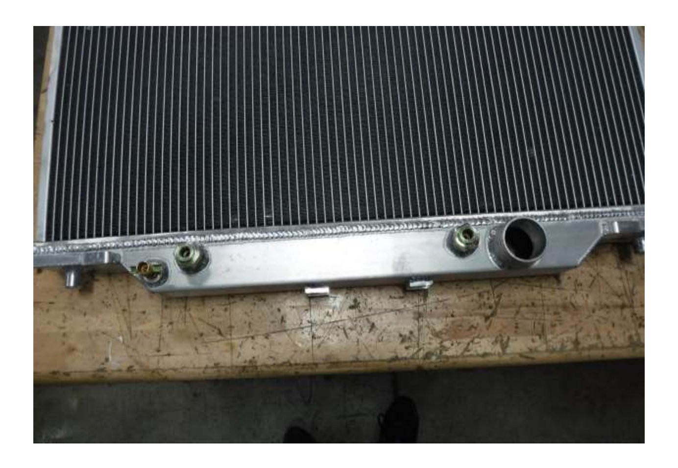
Note: Identify the correct style transmission cooler line fitting (A, B, or C) for your vehicle.

<u>Note: Be sure to lubricate the O-rings with grease to prevent them from tearing during installation.</u>