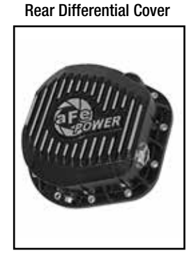
P/N: 46-70022 (Blk./Mach.) 46-7020 (RAW) Oil Filter