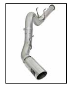
P/N: 49-03090-B (Blk Tip) 49-03090-P (Pol Tip)