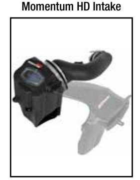
P/N: 50-73006 (P10R) 51-73006 (PDS)