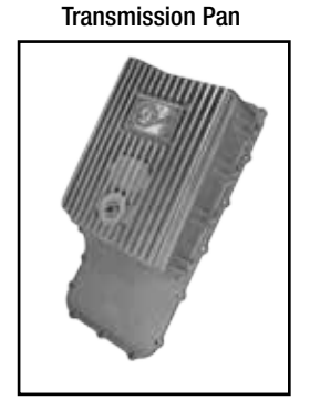
P/N: 46-70180 (RAW) 46-70182 (Blk./Mach)