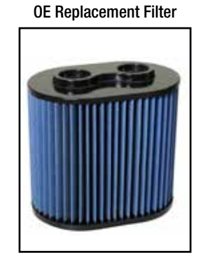
P/N: 10-10139 (P5R) 11-10139 (PDS) 71-10139 (PG7) 5" DPF-Back Exhaust