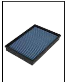
OE Replacement Filter