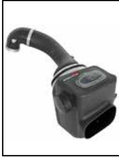
Momentum HD Intake