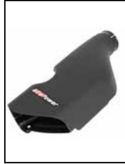
Dynamic Air Scoop