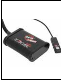
SCORCHER HD Module

P/N: 77-44005 (LB7) 77-44006 (LLY/LBZ/LMM)