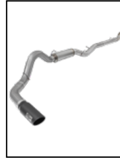
5" Race Exhaust

P/N: 49-44060-B (Blk. Tip) 49-44060-P (Pol. Tip) (LB7/LLY/LBZ/LMM)