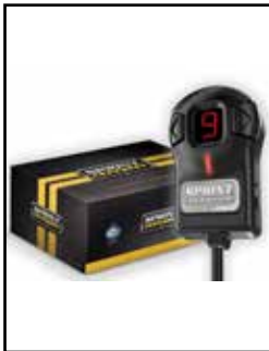
Sprint Booster V3