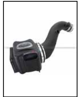
Intake System "Momentum"

P/N: 50-74001 (LB7) 50-74002 (LLY) 50-74003 (LLY/LBZ) 50-74004 (LMM)